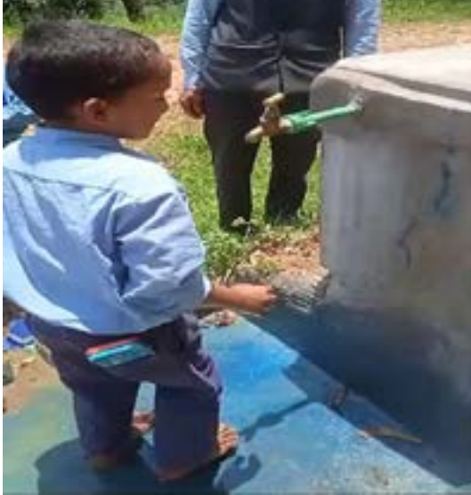
1500 Children have access to computer education , similarly 1200 Students have safe drinking water facility in public schools supported by BMZ/KKS/GONESA in Rupa Rural Municipality.